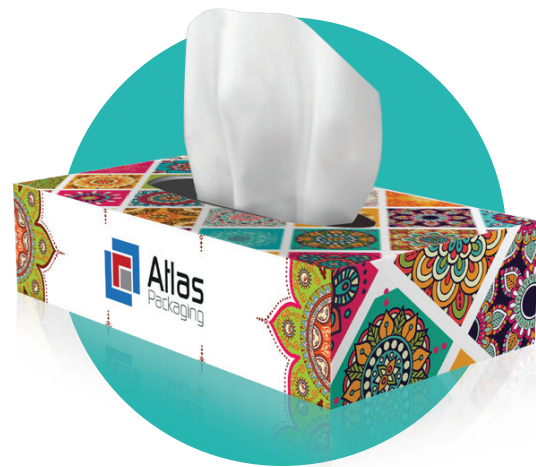
Tissu Boxes with window Patch